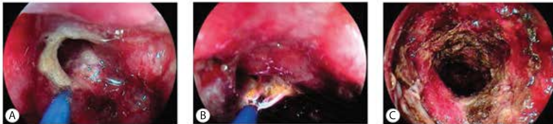
(A) Esophageal cancer pre-treatment. (B) APC treatment of the tumor. (C) Esophageal cancer following treatment.